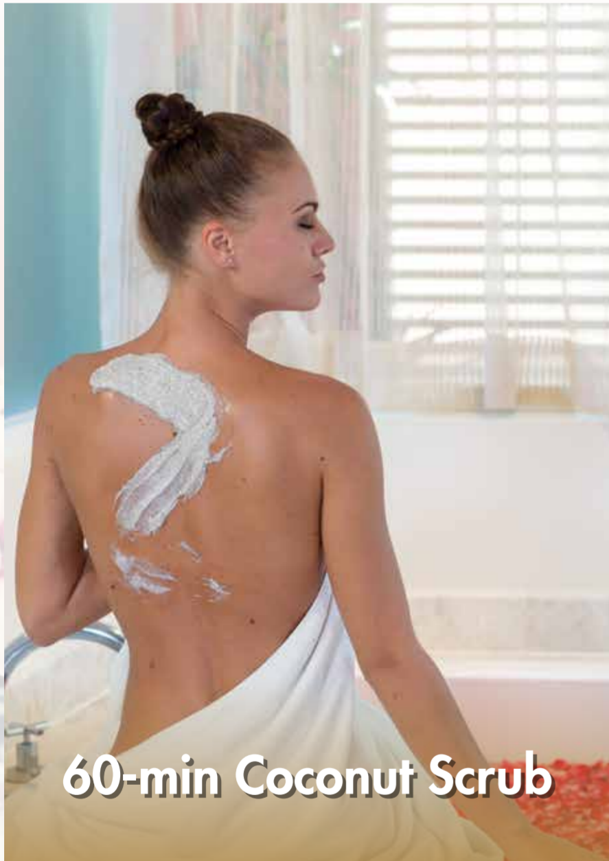
60-min Coconut Scrub